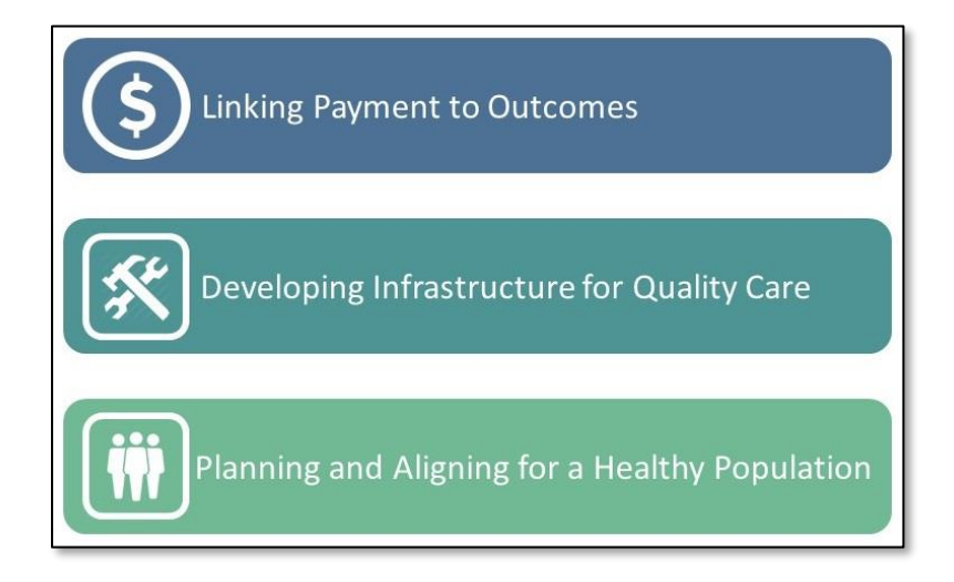
Figure 4: SIM Health Transformation Strategies

This has encouraged us to find more creative ways to carry out these activities, leading to our Integration and Alignment project. By identifying ways that state departments were already undertaking population health improvements, we have been able to spark collaborations that leverage people and dollars both inside and outside state government. Details of these three strategies are woven throughout the SIM Operational Plan.